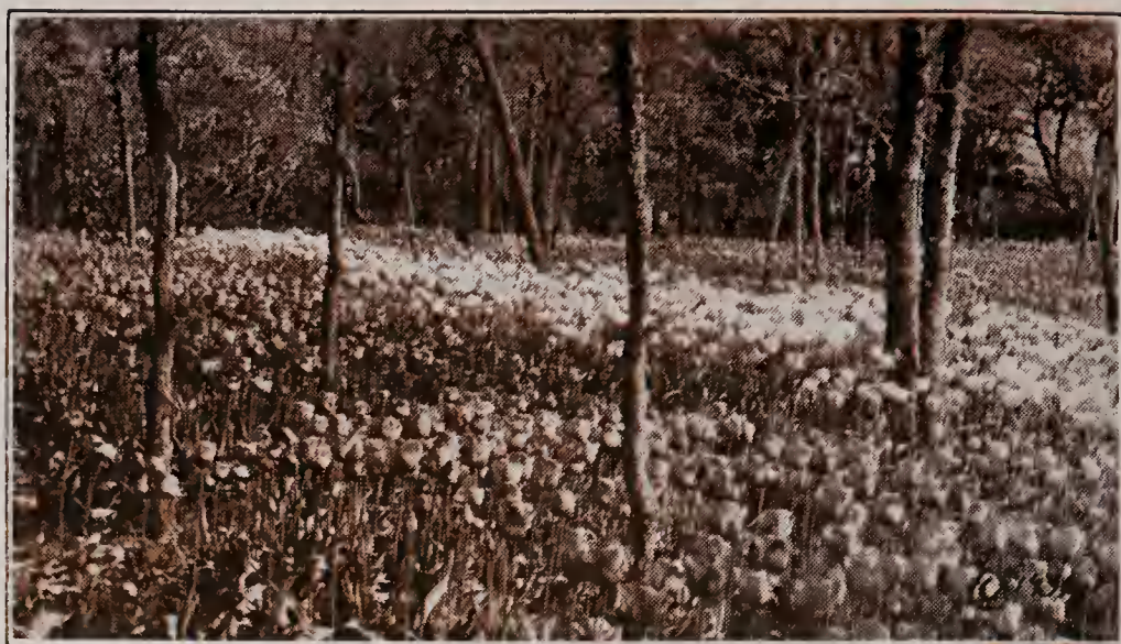
ONE OF OUR LOCAL TULIP PLANTINGS.